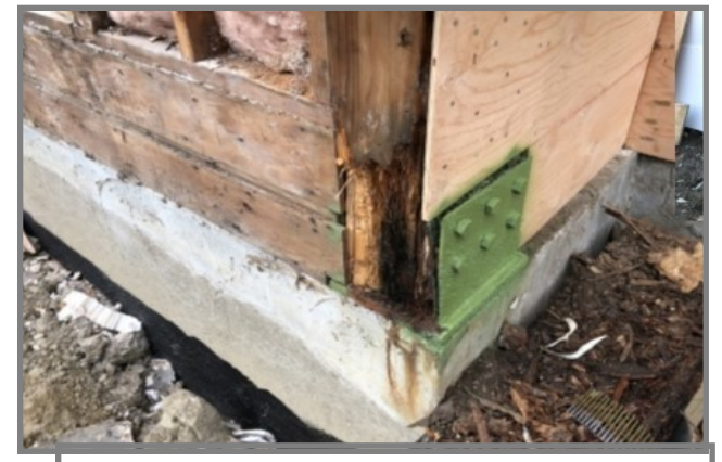
Damage to transept area