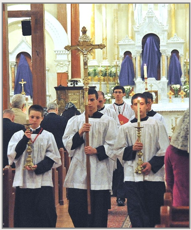
Lenten Mass at Christ the King Church, Ridgefield, CT