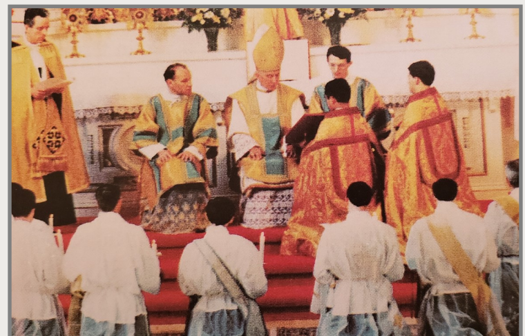
Early priestly ordinations in Ridgefield