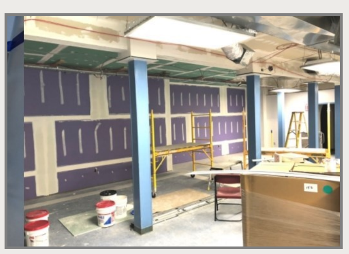
Total gutting and reconstruction of Academy