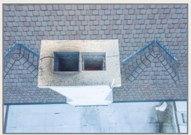
The many chimneys must be capped and tuck pointed