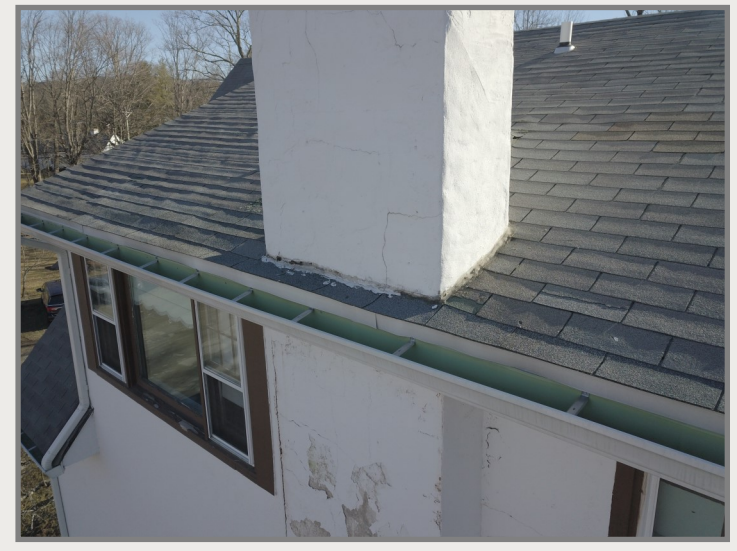
Roof, chimney and façade repairs needed on St. Joseph's

The Grounds and Property: Here, amidst the grading, drainage and masonry work around the church, the grounds need well and pump repair and tank removal and replacement. Driveway paving and the installation of proper lighting will ensure that parishioners, retreatants and guests may easily and safely traverse our property. We also hope to remodel the boathouse for practical storage and usage, reconstruct the entire "Old Garden Area" and build a playground for the children.