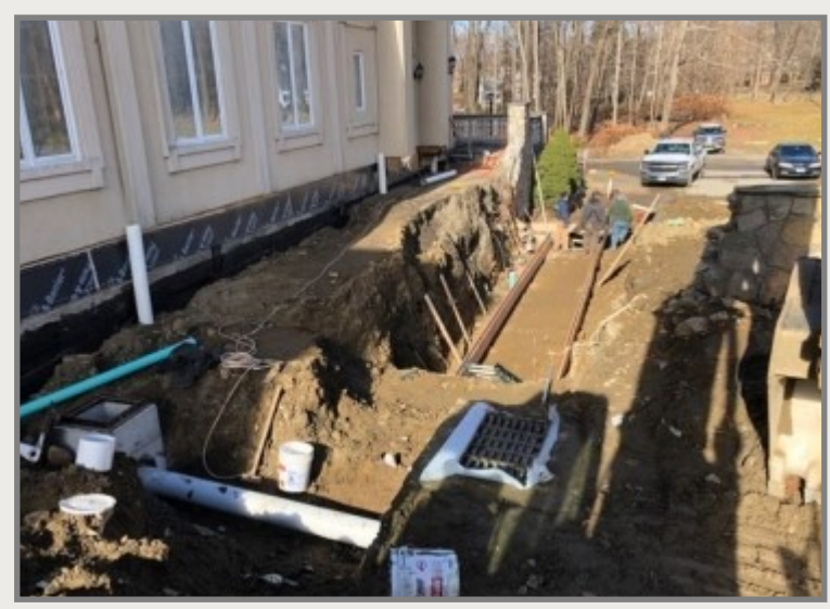
Drainage installation and grading

Additional renovations include repair of the bell tower, new steps on the front and side entrances and air conditioning for the church and school to help control humidity and prevent new mold contamination.