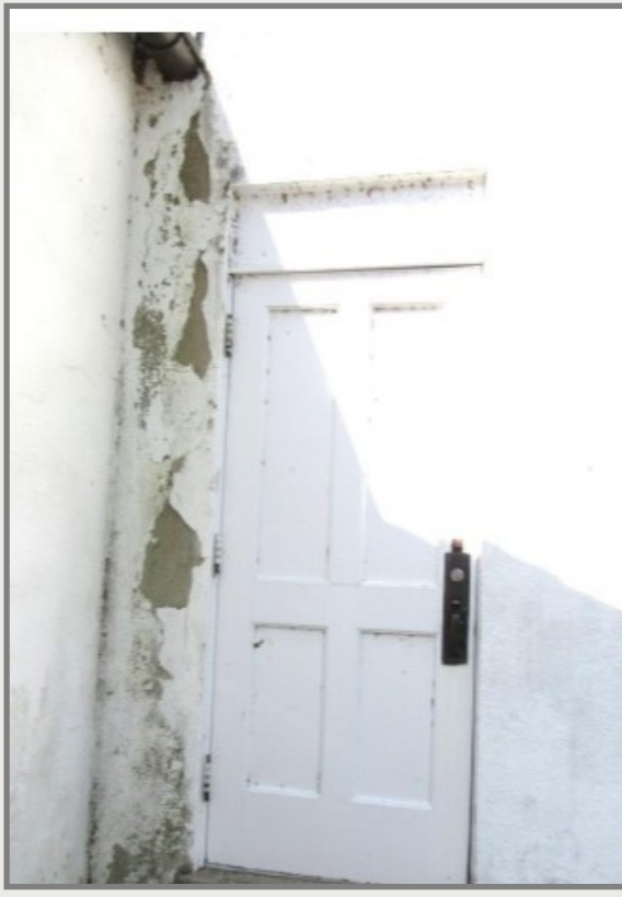
Example of extensive stucco damage

Interiorly, the chapel requires ceiling and air conditioning replacement, while the house requires bathroom renovations and painting throughout. Upgraded technology is also required, including installation of a new house bell system and phone system.