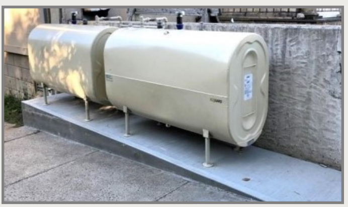
New oil tanks and pad