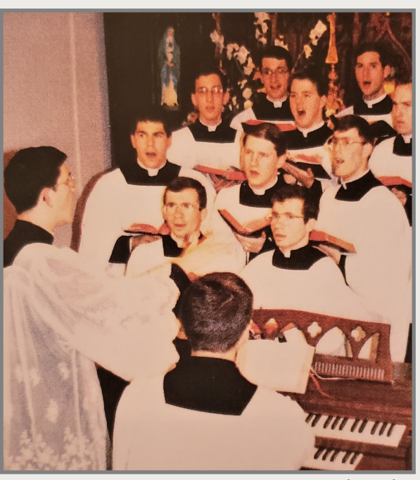
Seminarians sing in Retreat House chapel