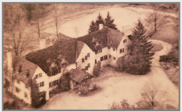
Mamanasco Lake Lodge, c. 1940

Finally purchased by the SSPX in 1978, it became St. Thomas Aquinas Seminary.