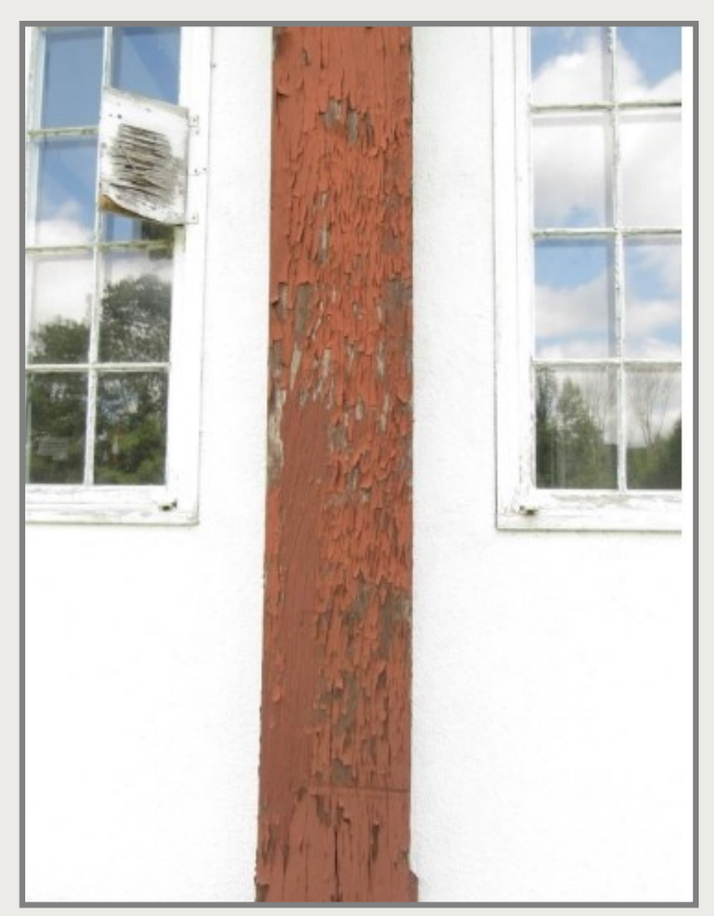
Damage to wood trim throughout exterior