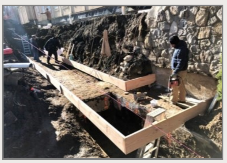
Reconstruction of retaining wall and stonework