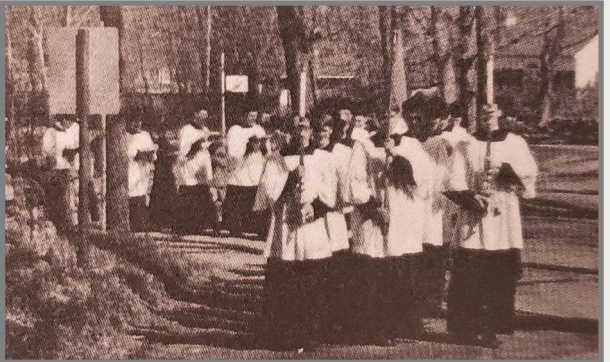
Seminarians process through Ridgefield