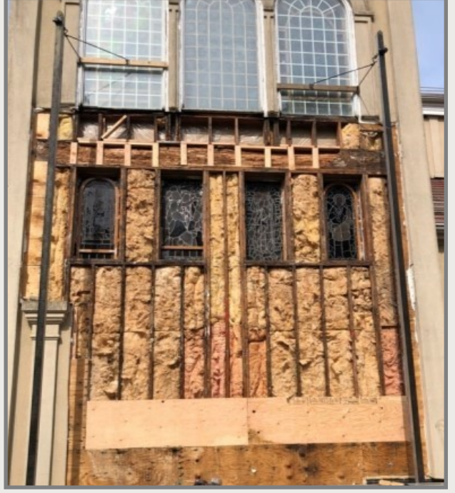
Extensive façade repair