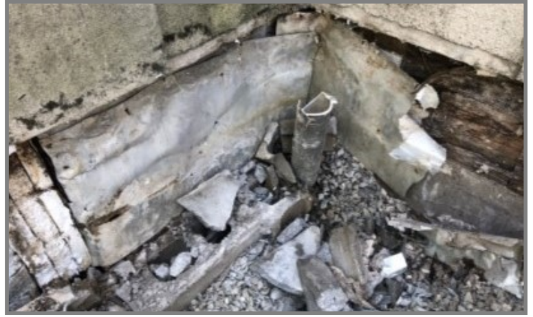
Damage to East side