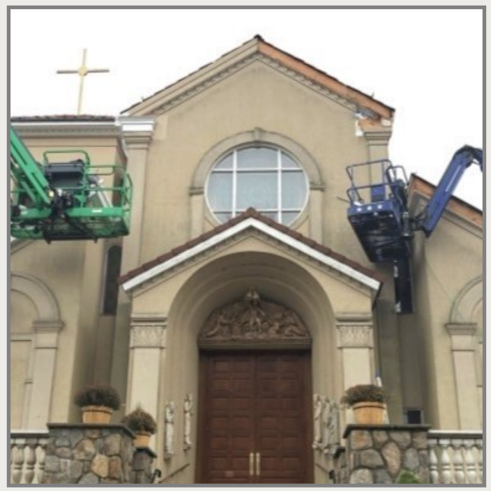
Choir loft window and façade repair

This deterioration caused water infiltration behind the faux stucco in many areas, the transept and cupola windows being the most problematic. Roof tiles in many areas required full replacement, along with the trim and gutters which were not adequate for the task. Rot-proof composite material was used, and the gutters and downspouts were upgraded based on engineering design calculations.