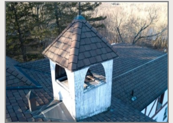
Retreat House bell tower in need of repair