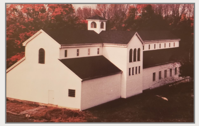
Building as it stood vacant

As parishioner numbers grew while using the small basement chapel of the Retreat House, so did the need for the Church. Finally, nearly two decades after construction began, Christ the King Church opened its doors for Christmas Midnight Mass in the year 2000.